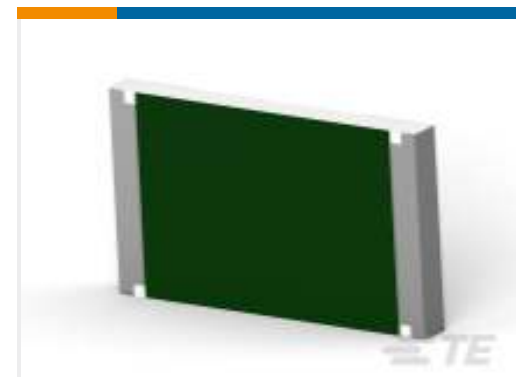
TE Part #8-2176407-8 3560 27R 5%