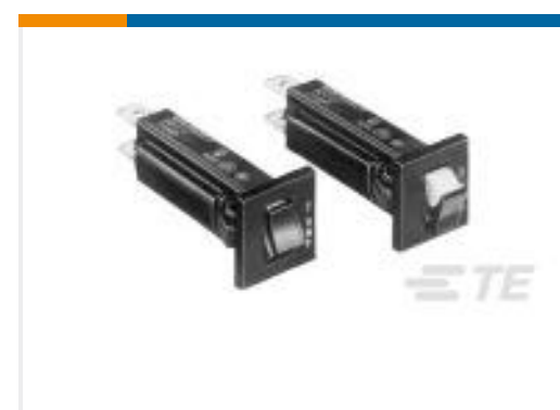
TE Part #1-1393250-7 W28-XQAT-15=W28