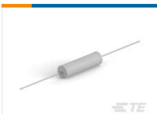
TE Part #4-2176414-8 7W STD M/OX 5% 1K8