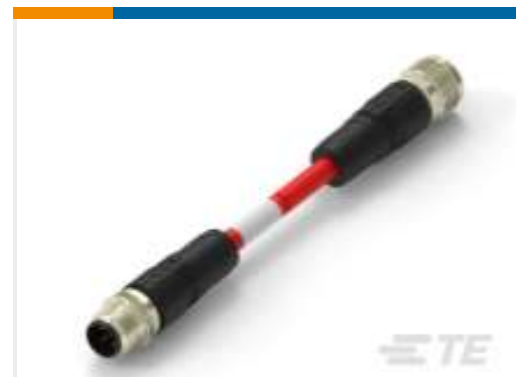
TE Part #TAA545B1411-060 M12A4-MS-FS-PVC-6.0M