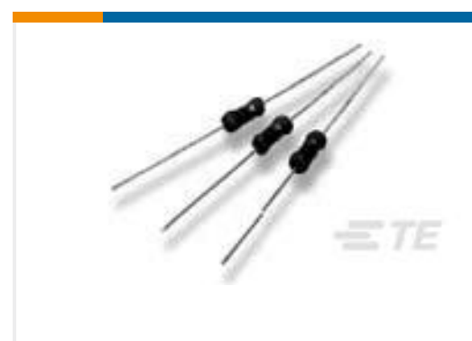
TE Part #4-1879350-2 RR01 5% 11R AMMO