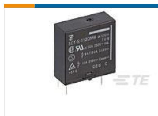
TE Part #8-1419125-5 SDT-S-106LMR,000