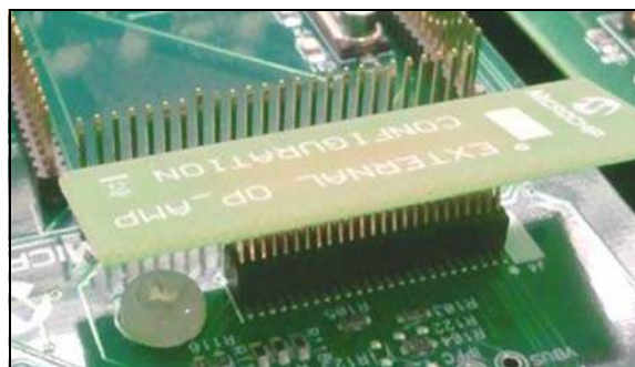
FIGURE 2: EXTERNAL OP AMP CONFIGURATION BOARD