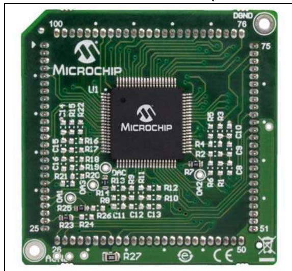
FIGURE 2: EXTERNAL OP AMP CONFIGURATION BOARD