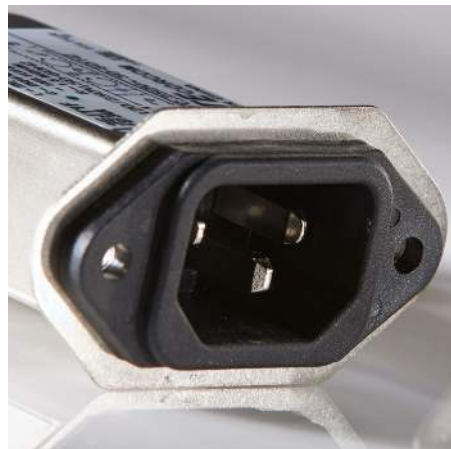
EJT Flanged EMI Filter