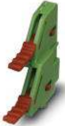
Ejectors, for assembly on each side of the header

Please be informed that the data shown in this PDF Document is generated from our Online Catalog. Please find the complete data in the user's documentation. Our General Terms of Use for Downloads are valid ( http://phoenixcontact.com/download )