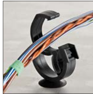
Automatic Harness Clip open.