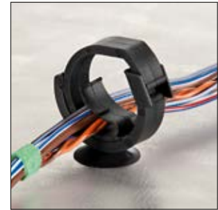
Automatic Harness Clip closed.