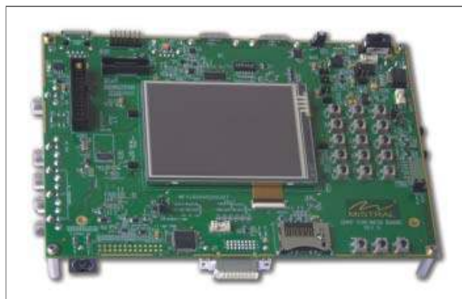
AM/DM37x Evaluation Module