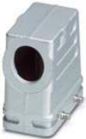
HEAVYCON sleeve housing B10, for double locking latch, height 70 mm, with thread M32, lateral cable outlet, EMC version

Please be informed that the data shown in this PDF Document is generated from our Online Catalog. Please find the complete data in the user's documentation. Our General Terms of Use for Downloads are valid ( http://download.phoenixcontact.com )