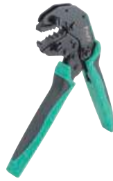
902-085 GrimPro Crimp Frame