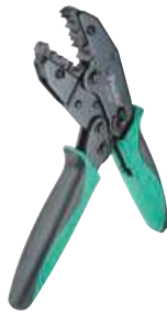
300-054 Lunar Crimp Frame