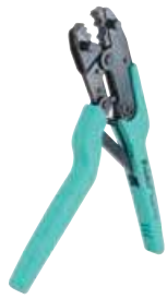
300-096 Ergo-Lunar Crimp Frame