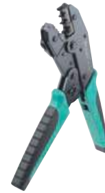
CP-3005F Quick Interchange Patcheting Crimper Frame

Note: CP-3005F sold as frame only, but all dies on this page fit it