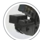
Phillips long screw that holds the locator in place