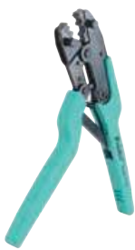
300-096 Ergo-Lunar Crimp Frame