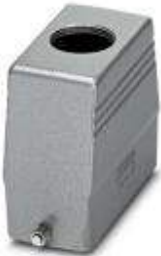
HEAVYCON B16 sleeve housing, for single locking latch, height: 76 mm, with 1 x M32 thread, straight cable outlet

Please be informed that the data shown in this PDF Document is generated from our Online Catalog. Please find the complete data in the user's documentation. Our General Terms of Use for Downloads are valid ( http://download.phoenixcontact.com )