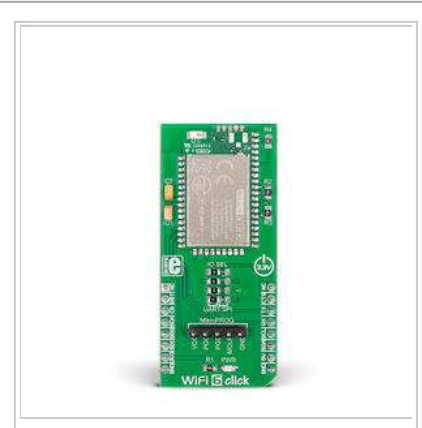
WiFi 6 click