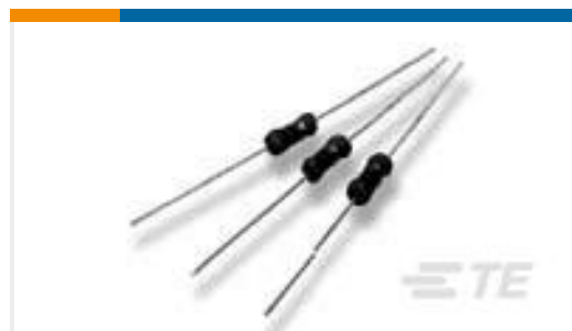
TE Part #2-1879352-1 RR02 5% 2R2 AMMO