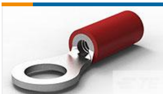
TE Part #32952 PG R 22-16 COMM 22-18 MIL 10