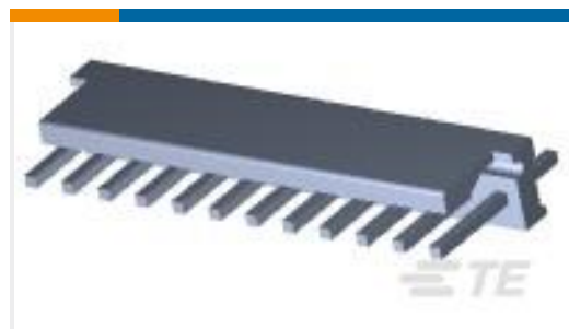
TE Part #1-644752-2 12P MTA156 HDR ASSY SQ STR F/L