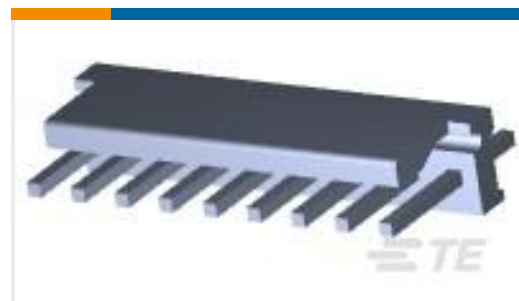
TE Part #644752-9 09P MTA156 HDR ASSY SQ STR F/L