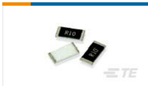
TE Part #2-2176054-4 RLP73N 2A R47 5% 5K RL