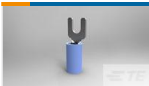
TE Part #1-328281-1 TERMINAL,PIDG SPD 16-14 6