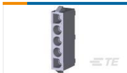
TE Part #640467-1 05P UMNL HDR ASSY