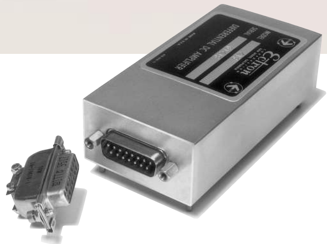
Model 416 rear view, with mating DAM-15S connector