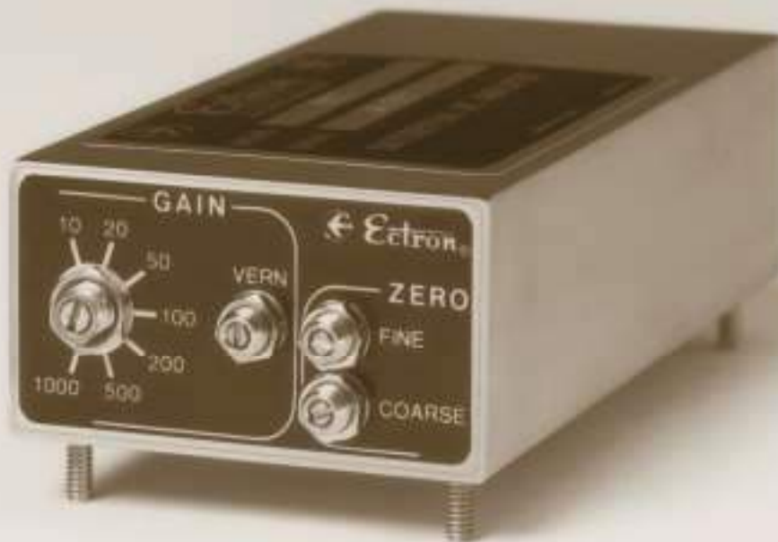
Model 416 front view. See specifications for size.