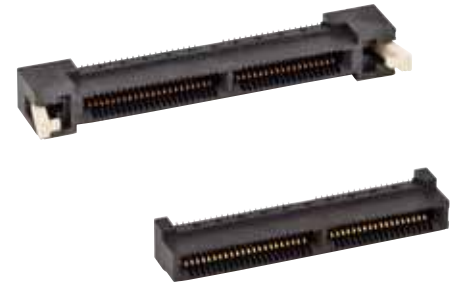
3M™ High-Speed Card-Edge Connectors, with and without latch