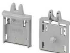
Adapter for direct mounting

Please be informed that the data shown in this PDF document is generated from our online catalog. Please find the complete data in the user documentation. Our general terms of use for downloads are valid.