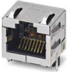
RJ45 socket insert, for PCB assembly, CAT6 A , 8-pos., shielded, with angled solder pins, 1x

Please be informed that the data shown in this PDF Document is generated from our Online Catalog. Please find the complete data in the user's documentation. Our General Terms of Use for Downloads are valid ( http://download.phoenixcontact.com )