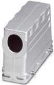
HEAVYCON sleeve housing B24, for double locking latch, height 76 mm, with thread M40, lateral cable outlet, EMC version

Please be informed that the data shown in this PDF Document is generated from our Online Catalog. Please find the complete data in the user's documentation. Our General Terms of Use for Downloads are valid ( http://download.phoenixcontact.com )