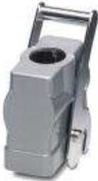
HEAVYCON sleeve housing B16, with main latch, height 76 mm, with 1x M32 thread, straight conductor outlet

Please be informed that the data shown in this PDF Document is generated from our Online Catalog. Please find the complete data in the user's documentation. Our General Terms of Use for Downloads are valid ( http://phoenixcontact.com/download )