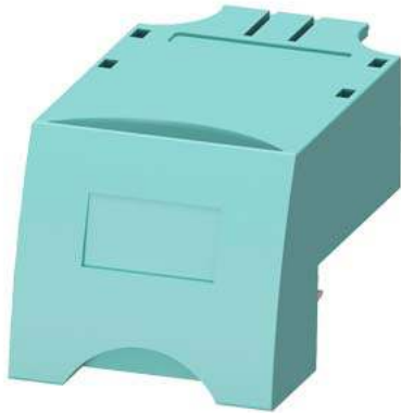
Cable connector size S00 Spring-type terminal