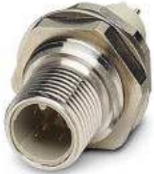
Sensor/Actuator flush-type plug, 5-pos., M12, A-coded, rear/screw mounting with Pg9 thread, with straight solder connection

Please be informed that the data shown in this PDF Document is generated from our Online Catalog. Please find the complete data in the user's documentation. Our General Terms of Use for Downloads are valid ( http://download.phoenixcontact.com )