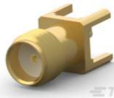
TE Part #5-1814832-2 SMA Str PCB Skt GZD