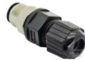
TE Part #1838275-2 M12 Fld Ser CONN. Male Pin Sld