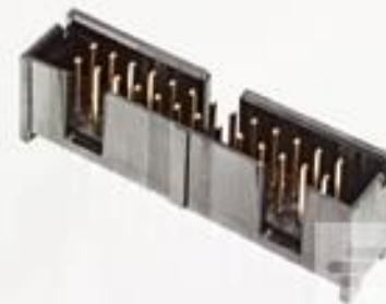
TE Part #5103309-2 A/L LOW PRO HDR 14P VERT BLACK