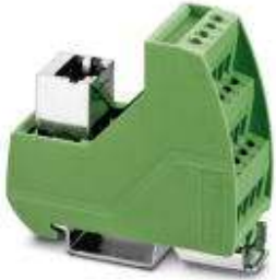
VARIOFACE module with screw connection and RJ45 connector

Please be informed that the data shown in this PDF Document is generated from our Online Catalog. Please find the complete data in the user's documentation. Our General Terms of Use for Downloads are valid ( http://phoenixcontact.com/download )