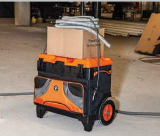
Hard top allows for stacking materials on top