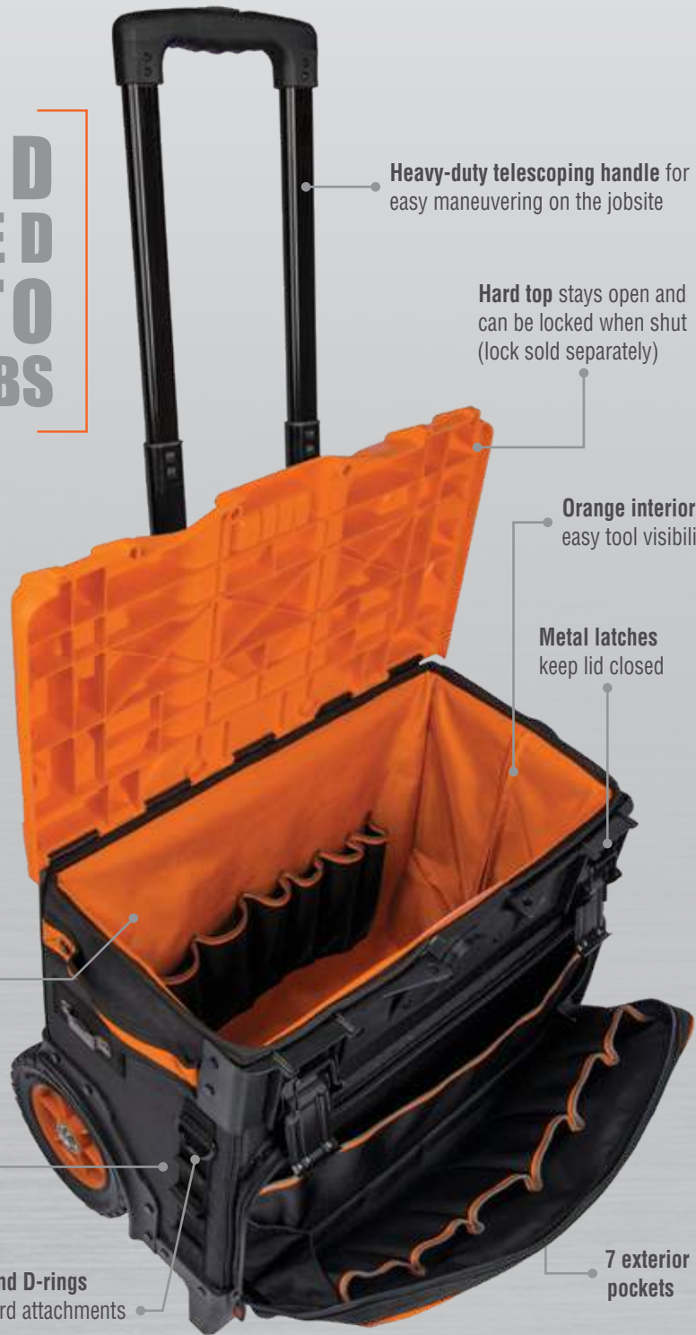
Heavy-duty telescoping handle for easy maneuvering on the jobsite