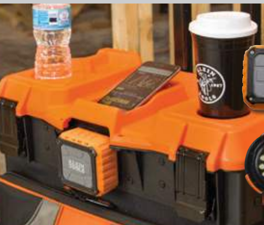
Twist-lock the Klein LED Light (55437) or Wireless Speaker (AEPJS1) on front mount (items sold separately)