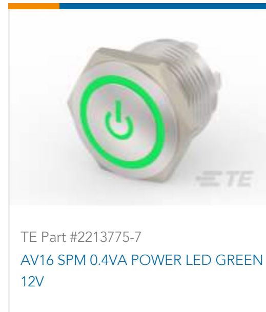
TE Part #2213775-7 AV16 SPM 0.4VA POWER LED GREEN 12V