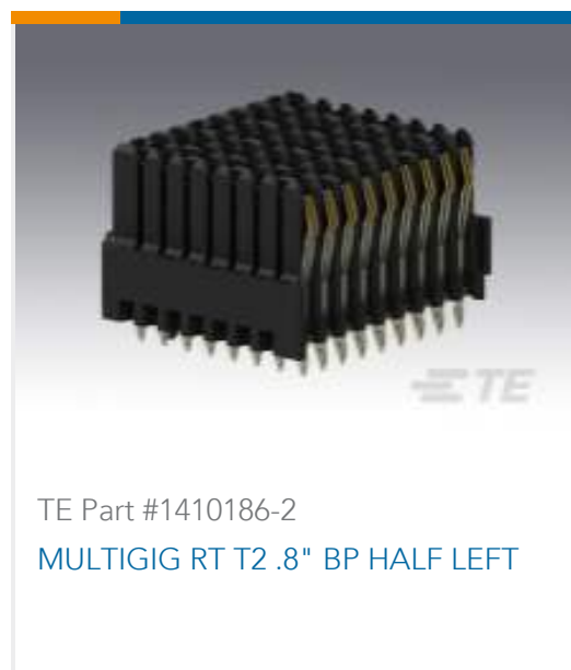
TE Part #1410186-2 MULTIGIG RT T2.8" BP HALF LEFT