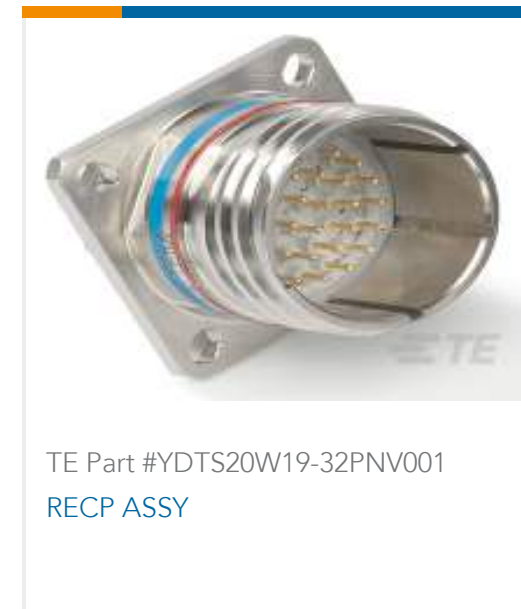
TE Part #YDTS20W19-32PNV001 RECP ASSY