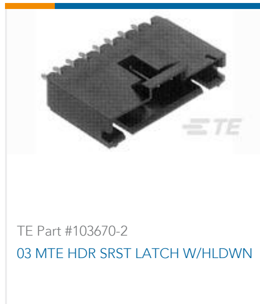
TE Part #103670-2 03 MTE HDR SRST LATCH W/HLDWN