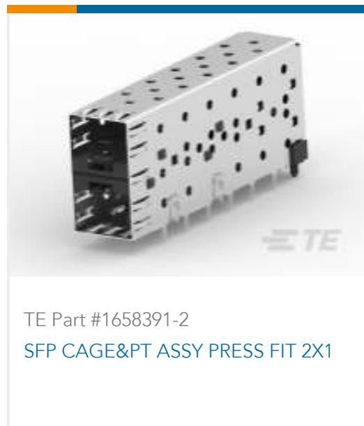
TE Part #1658391-2 SFP CAGE&PT ASSY PRESS FIT 2X1