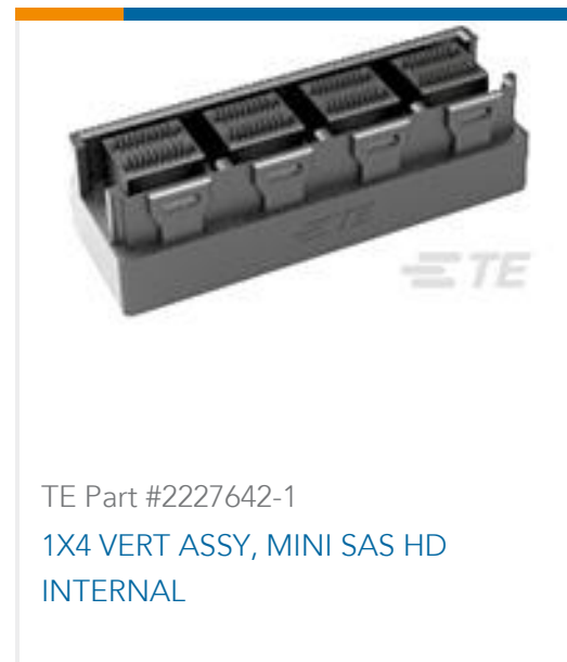
TE Part #2227642-1 1X4 VERT ASSY, MINI SAS HD INTERNAL