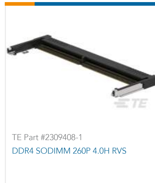
TE Part #2309408-1 DDR4 SODIMM 260P 4.0H RVS