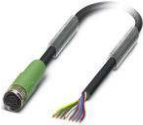
Sensor/Actuator cable, 8-position, PUR, Black RAL 9005, Free cable end, on Socket straight M8, Cable length: 5 m

Please be informed that the data shown in this PDF Document is generated from our Online Catalog. Please find the complete data in the user's documentation. Our General Terms of Use for Downloads are valid ( http://download.phoenixcontact.com )