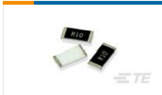
TE Part #3-2176058-7 RLP73K 3A R33 5% 2K RL