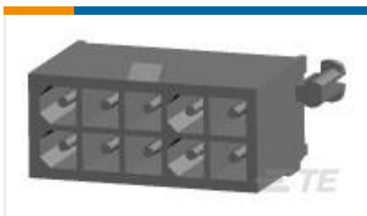
TE Part #1-770743-0 10P MINI UMNL HDR ASSY D/R VRT