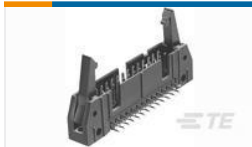
TE Part #1-5499786-1 A/L UNIV HDR 60P RA LG LAT