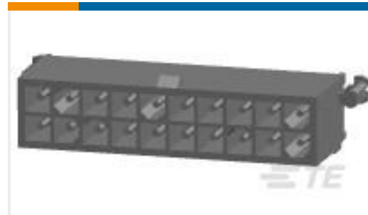
TE Part #1-794070-0 20P MINI UMNL HDR W/DH SN LF