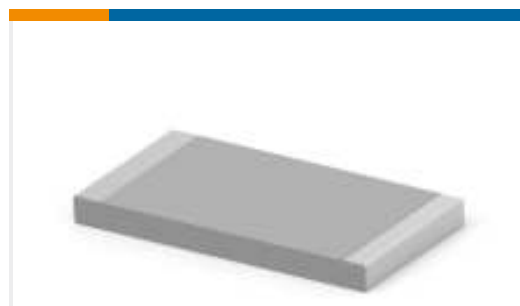
TE Part #2-2176331-2 CRGP 2512 560R 1%