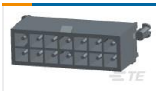
TE Part #1-794067-0 14P MINI UMNL HDR W/DH SN