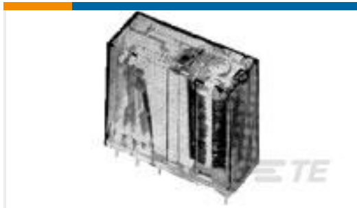
TE Part #1393258-4 V23047-A1012-A501