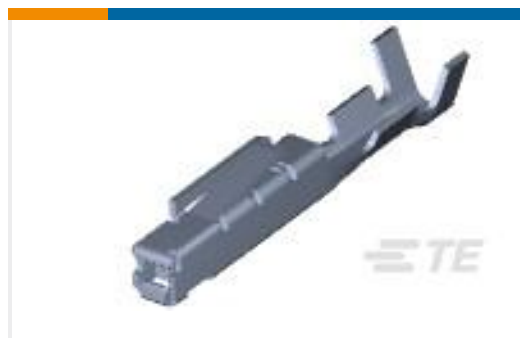
TE Part #1318108-1 DYNAMIC D-2000 REC CONT S L/P