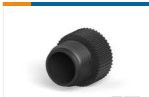
TE Part #2823064-1 M12-DUST CAP-FEMALE CONN-IP67-W/O SLEEVE