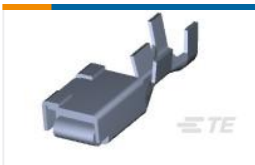
TE Part #316040-2 DYNAMIC D-5 REC CONT. S L/P