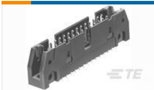
TE Part #5102156-5 A/L UNIV HDR 24P VERT