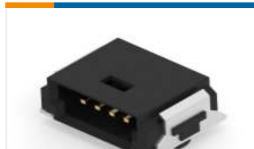
TE Part #214012-E SRCA 1,27 4 M 1 SMD 137 E1 094 * GURT *