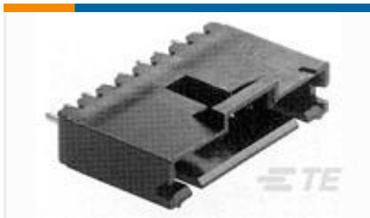
TE Part #5-104363-4 05 MTE HDR SRST LATCH .100CL