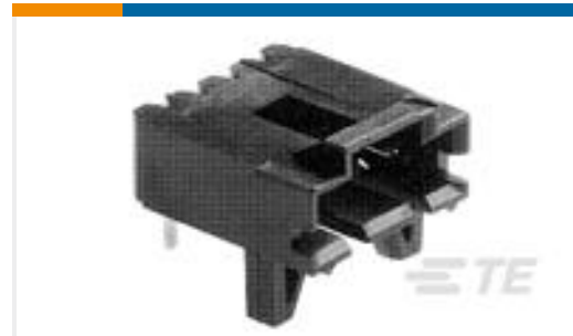
TE Part #5-103673-8 9 MTE HDR SRRA LATCH W/HLDWN