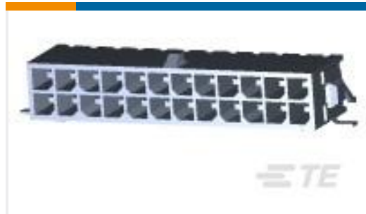
TE Part #5-794629-4 24P MICRO MNL ASSY,R/A,SMT,LF