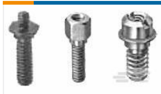
TE Part #749087-1 50SR SCREWLOCK KIT,FEMALE