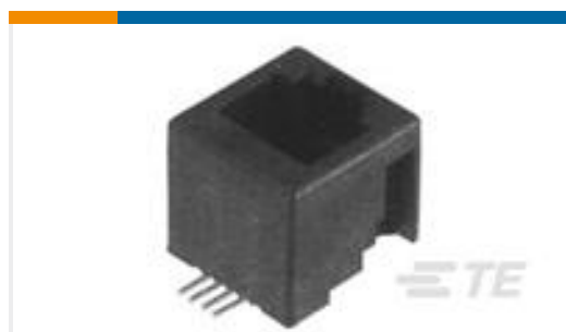
TE Part #1-338086-3 6/6 INV.MOD JACK