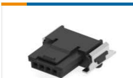
TE Part #364485-E SRCP 1,27 4 F 1 SMD 137 * 094 * GURT RLV