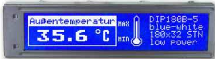
EA DIP180B-5NLW Dimension 102 x 27 mm