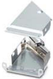
D-SUB EMC inner sleeve, shell size 3, for sleeve housing VS-25-...

Please be informed that the data shown in this PDF Document is generated from our Online Catalog. Please find the complete data in the user's documentation. Our General Terms of Use for Downloads are valid ( http://download.phoenixcontact.com )