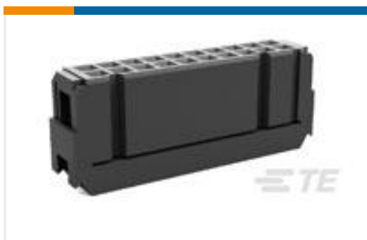
TE Part #1658620-8 34 NOVO MIL 15DP, LEAD FREE