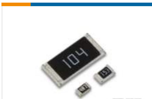
TE Part #4-2176345-1 CRGCO 1210 22K 1%