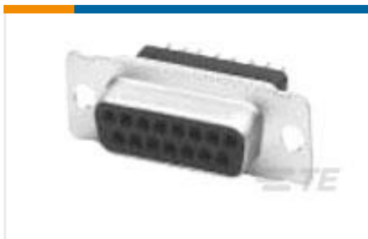
TE Part #5747190-4 09 RCPT SP/MS CNUT