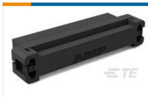
TE Part #1-111623-8 10, 2MM, POL,30 DP, LEAD FREE