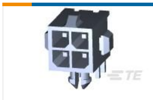
TE Part #3-794620-4 04P MICRO MNL ASSY,R/A,HDR,LF