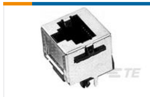
TE Part #5557484-1 MJ,TE,8P,SHLD,LOW PNL STR