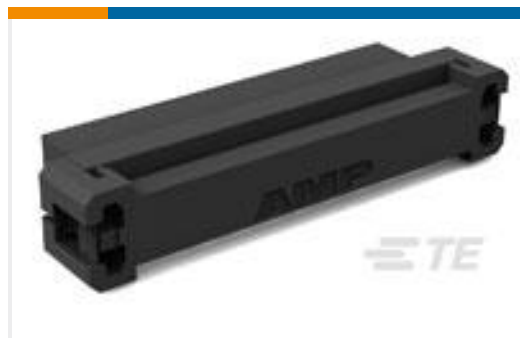
TE Part #2-111623-1 20, 2MM, POL,30 DP, LEAD FREE