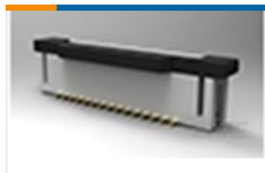
TE Part #1-1734248-4 1.0 FPC, ZIF V/T, SMT, 14P