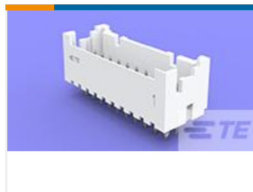
TE Part #1-1969543-0 ASSY, HDR, VERT, 10P, DUAL ROW, EP2.5