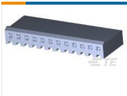
TE Part #1-647401-2 12P SL156 HSG W/RAMP,LRG OPEN