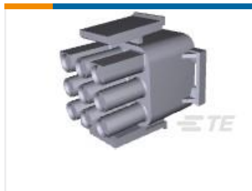
TE Part #794537-1 09P UMNL PLUG HSG 150C BLK