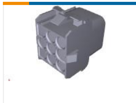
TE Part #794538-1 09P UMNL CAP HSG 150C BLK