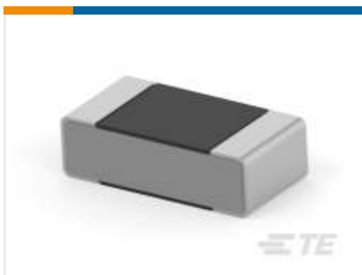
TE Part #5-1879212-7 CPF 0402 82K5 0.1% 25PPM 5K RL