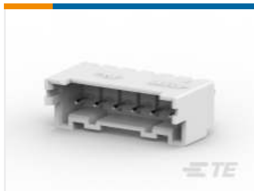
TE Part #1969730-6 EP2.5 SHROUDED HDR ASSY 6P VERTICAL