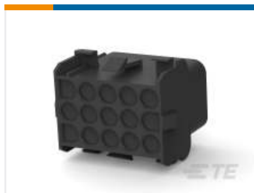
TE Part #794745-1 15P UMNL CAP HSG BLACK