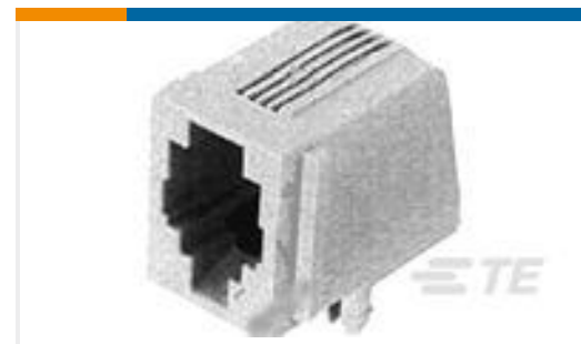
TE Part #5554517-1 MJ,R/A,8P/8C,KEYED,TRAY PACK