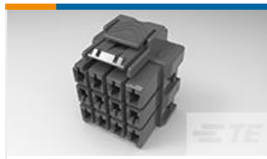
TE Part #5-2232357-4 PTL 3X4 PLUG HSG GLW WIRE KEY A DGR