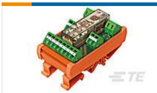
TE Part #5-1415033-1 SR6ZB024