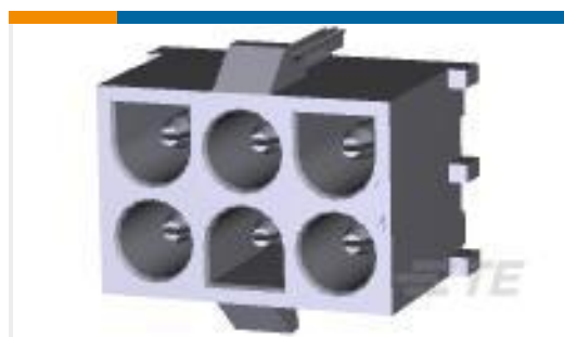
TE Part #641969-1 06P UMNL PIN HDR ASSY V2 NATL