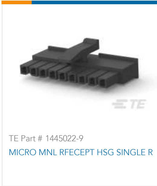
TE Part # 1445022-9 MICRO MNL RFECEPT HSG SINGLE R