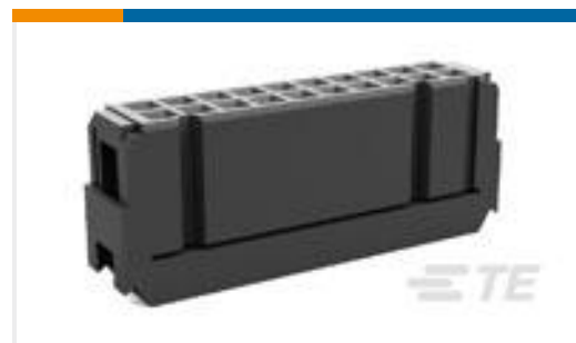
TE Part #1658620-8 34 NOVO MIL 15DP, LEAD FREE