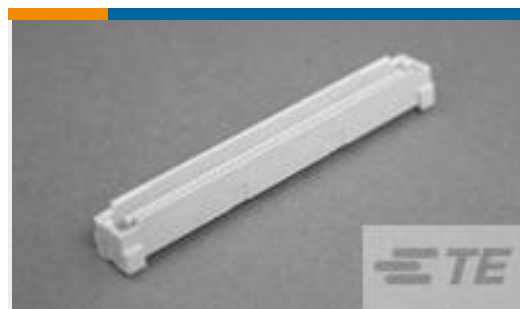
TE Part #1-5177986-1 0.8FH,P06H.5,040,08/Sn,TR,SC