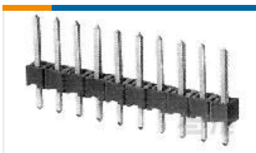
TE Part #825433-5 MOD 2 PINHDR 1X5 P.