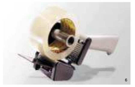
Scotch® Low Noise Tape Dispenser H-150 Lightweight pistol-grip dispenser for low noise application. Metal and high-impact plastic for durability. Up to 48 mm (2 inch) wide tape. Also available: H-153 for 72 mm wide tape.