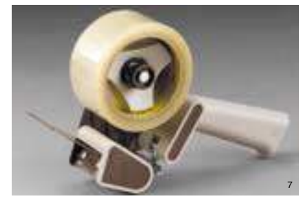
Scotch® Box Sealing Tape Dispenser H-180 Lightweight, pistol-grip dispenser with built-in adjustable brake for tight, consistent seal. Up to 48 mm (2 inch) wide tape. Also available: H-183 for 72 mm wide tape.