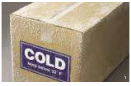
Scotch® Box Sealing Tapes are an outstanding choice for applications where tape is applied below 40°F.