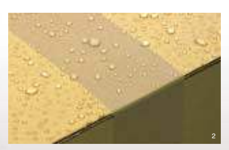
Scotch® Box Sealing Film Tapes resist moisture encountered in storage and shipping through the supply chain.