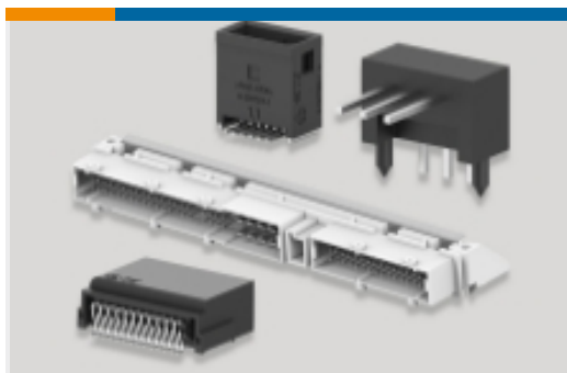
PCB Headers & Receptacles(173)