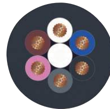
Cable cross section