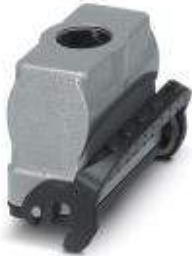
HEAVYCON B24 coupling housing, with single locking latch, height: 80.5 mm, with 1 x M25 thread, straight cable outlet

Please be informed that the data shown in this PDF Document is generated from our Online Catalog. Please find the complete data in the user's documentation. Our General Terms of Use for Downloads are valid ( http://download.phoenixcontact.com )