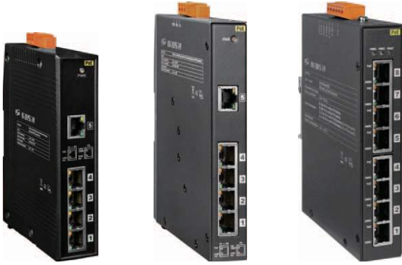
NS-205PSE-24V NSM-205PSE-24V NSM-208PSE-24V

5(8)-port 10/100 Mbps PoE (PSE) Ethernet Switch with +24 VDC Input