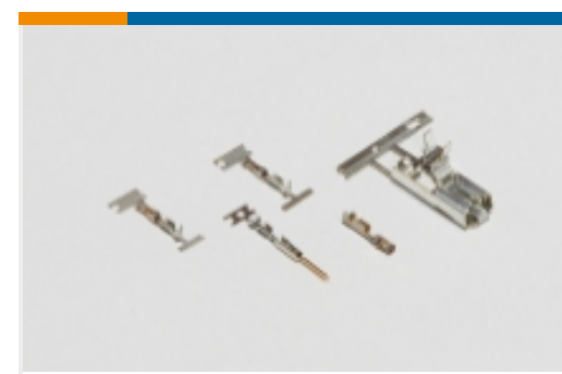
Wire-to-Board Connector Contacts(8)