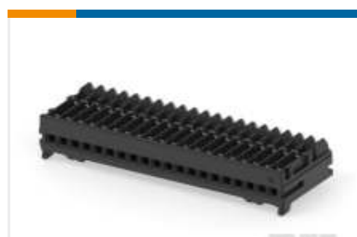
TE Part #2-2355088-0 MICRO CT CONN MT REC ASSEMBLY 20P