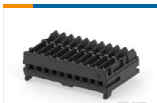
TE Part #1-2355088-0 MICRO CT CONN MT REC ASSEMBLY 10P