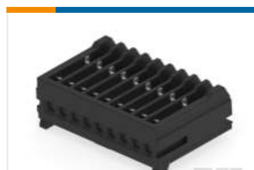
TE Part #2355088-9 MICRO CT CONN MT REC ASSEMBLY 9P