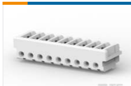
TE Part #2-179694-3 AMP COMMON TERMINATION HOUSINGS