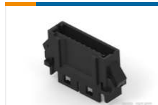
TE Part #3-292215-0 MINI CT SGL RELAY 10P BLACK