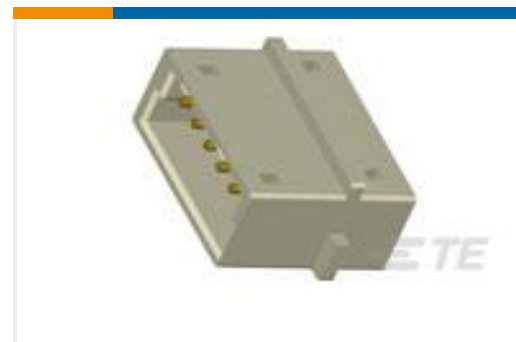
TE Part #2-292156-2 CT RELAY HDR ASSY FREE HANGING