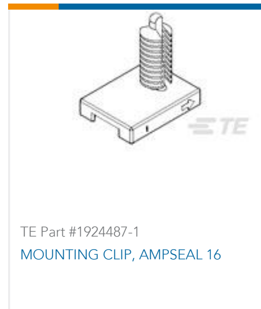
TE Part #1924487-1 MOUNTING CLIP, AMPSEAL 16