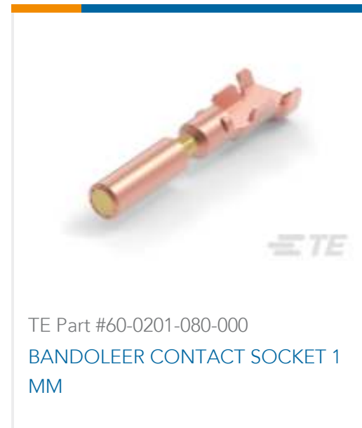
TE Part #60-0201-080-000 BANDOLEER CONTACT SOCKET 1 MM