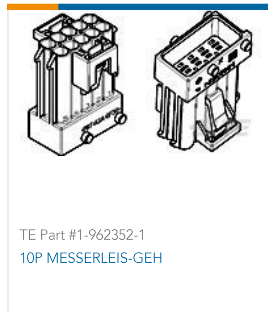
TE Part #1-962352-1 10P MESSERLEIS-GEH