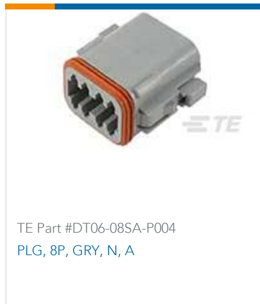
TE Part #DT06-08SA-P004 PLG, 8P, GRY, N, A