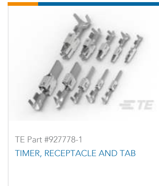
TE Part #927778-1 TIMER, RECEPTACLE AND TAB