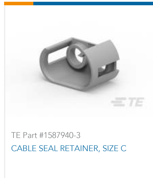
TE Part #1587940-3 CABLE SEAL RETAINER, SIZE C