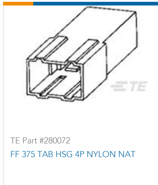
TE Part #280072 FF 375 TAB HSG 4P NYLON NAT