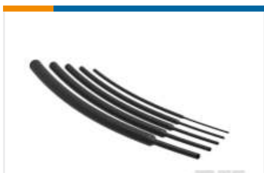
TE Part #NB13052001 RNF-100-1-BK-STK