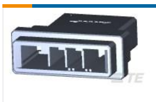
TE Part #1-179552-4 DYNAMIC D-3200S TAB HSG 4P K/X