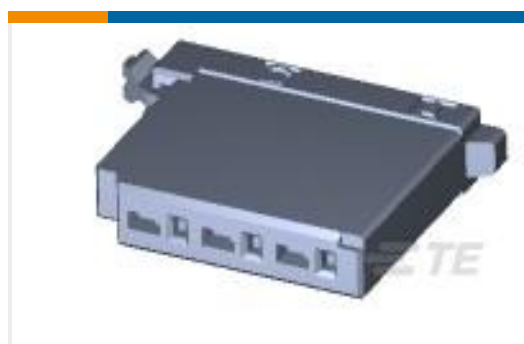
TE Part #1-1827579-1 DYNAMIC 1500T REC HSG 3P X BLACK