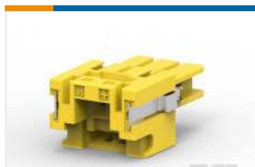
TE Part #1-2299959-1 TRAY PACKAGE.THERMOCOUPLE CONN KTYPE REC