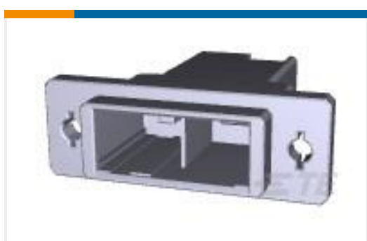
TE Part #1-353047-2 DYNAMIC D-5200S TAB HSG 2P K/X