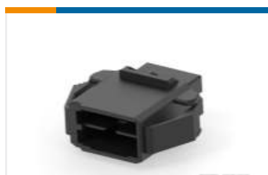
TE Part #3-204040-2 Receptacle and Tab Housing: 3.5 mm pitch, 250V