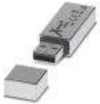
USB memory stick, 8 GB

USB memory stick - USB FLASH DRIVE - 2402809