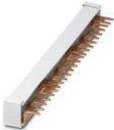
Wiring bridge for modules with connecting pitch 17.5 mm, 4-phase, 12-pos.

Please be informed that the data shown in this PDF Document is generated from our Online Catalog. Please find the complete data in the user's documentation. Our General Terms of Use for Downloads are valid ( http://phoenixcontact.com/download )