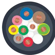
Cable cross section