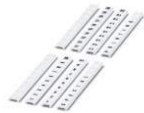
Zack Marker strip, flat, white, For terminal block width: 6.2 mm

Please be informed that the data shown in this PDF Document is generated from our Online Catalog. Please find the complete data in the user's documentation. Our General Terms of Use for Downloads are valid ( http://download.phoenixcontact.com )