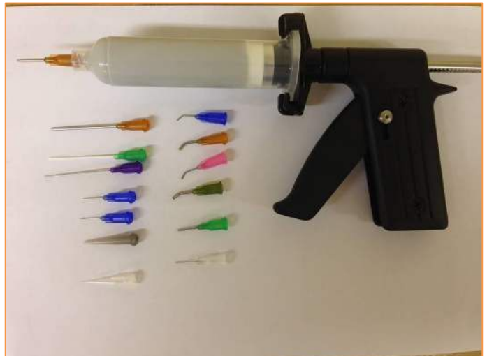
Dispenser Gun with all the TIPS