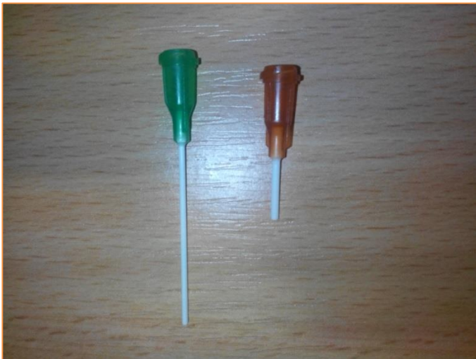
Flexible TIPS: Flexible polypropylene 38.1 mm or 12.7 mm (1.5" or 0.5") tubing for application onto sensitive areas. Easily drags along edges and around corners; flexible for access to hidden areas.