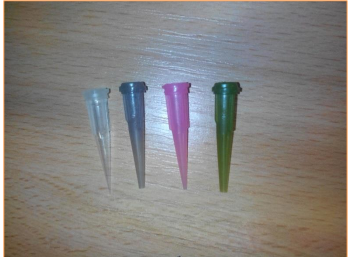
Smooth flow tapered TIPS: Unique tips provide smooth flow of all fluid types. Molded of polyethylene with UV-light block additive and SafetyLok™ hub design. Resists clogging of thick, particle-filled materials. Use with UV-cure adhesives, sealants and grease.