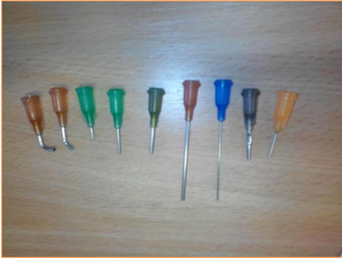
Precision Stainless Steel TIPS: Burr-free, polished and passivated stainless steel tips with polypropylene SafetyLok hubs.