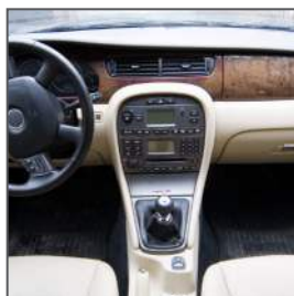
GPS / Car Audio