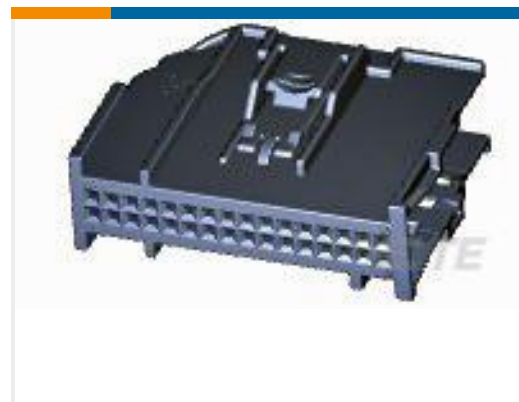
TE Part #2098660-1 32P Shield, GY HandMate