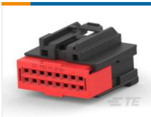
TE Part #1456989-1 2x8 Fem unsealed LP assy Key A