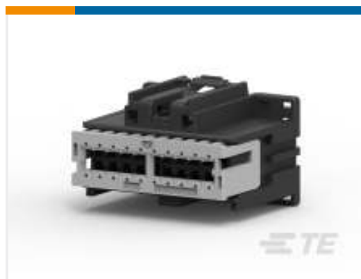
TE Part #2288276-1 Assy, Plug, USCAR, Gen Y, 20p, Key A, No CPA