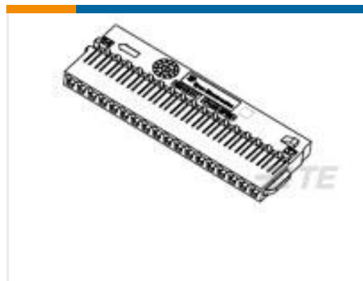
TE Part #1924341-1 18P, 1 Row Carrier for 54P LAC