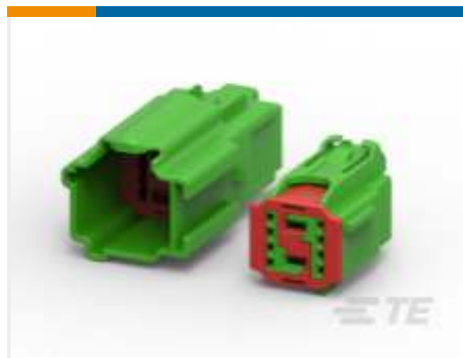
TE Part #1924639-1 GET .64 CONNECTOR SYSTEM, CONNECTOR HSG