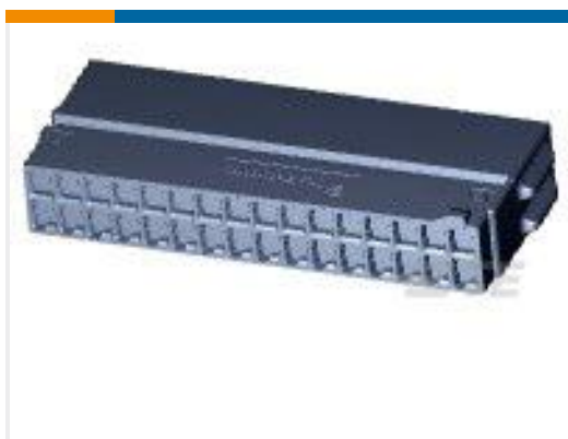
TE Part #2098216-1 32P Carrier, GY