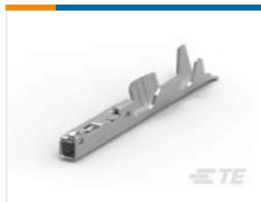
TE Part #2098583-2 Contact, 50 Series, fem, 0.35-