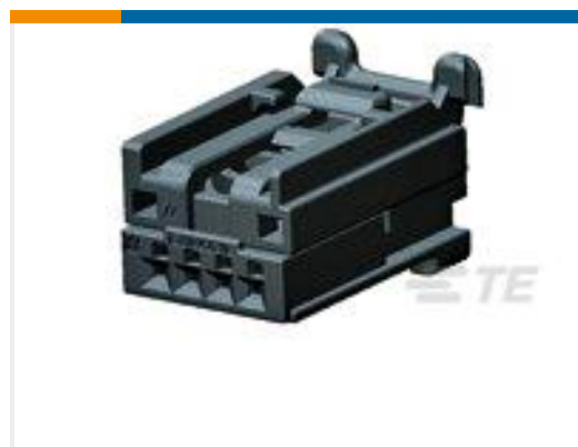
TE Part #2035360-1 1X4 GENERATION Y ASSY KEY A