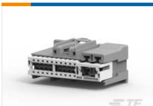
TE Part #2288274-2 24P HYBRID 0.64/2.8 PLUG ASSY, B KEY