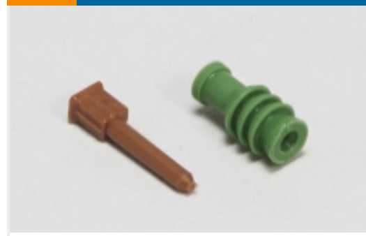
Automotive Seals & Cavity Plugs(27)