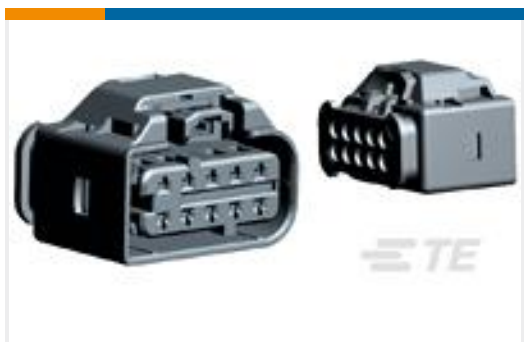
TE Part #1801600-2 RECEPTACLE HOUSING, MCON, 10 W, SEALED