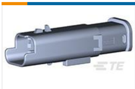
TE Part #1801174-1 2W TAB HP CONNECTOR BLACK