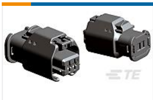
TE Part #1801175-1 2W RECEPTACLE HP CONNECTOR BLACK