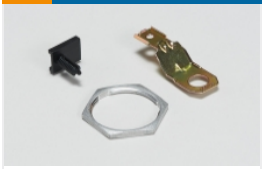
Other Automotive Connector Accessories(14)