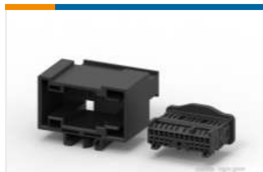
TE Part #953698-1 MQS, CONNECTOR HOUSING