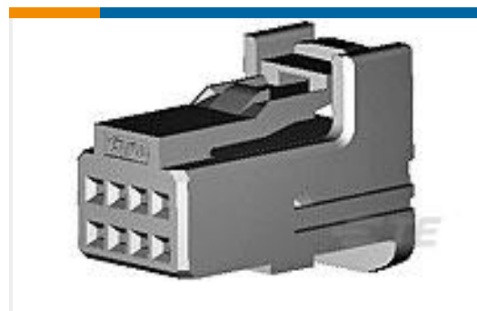
TE Part #1379659-3 8W PLUG HOUSING ASSY BLUE