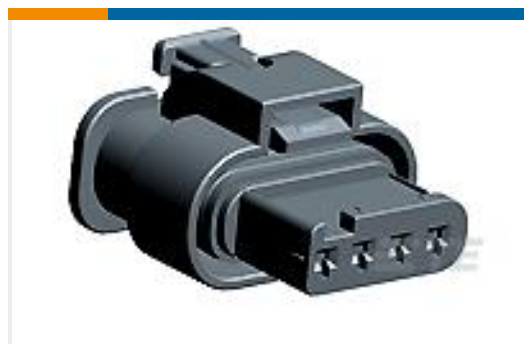
TE Part #1-1718645-1 4POS, MCON 1.2 LL REC SEALED