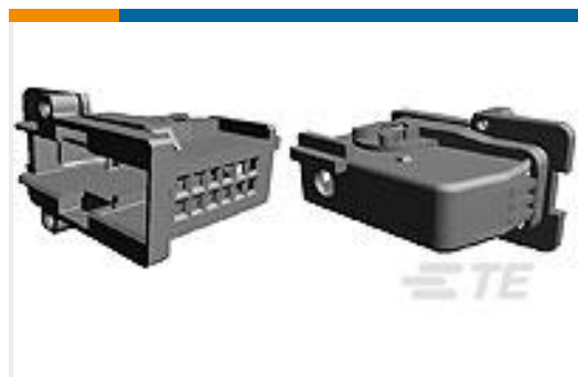
TE Part #1379095-2 COV+LEV MQS 12W 0DEG BLUE