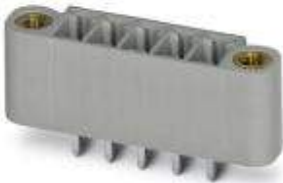
The figure shows the 5-pos. version of the product in gray

Header, Nominal current: 8 A, Rated voltage (III/2): 160 V, Number of positions: 18, Pitch: 3.5 mm, Color: black, Contact surface: Tin, Mounting: Wave soldering